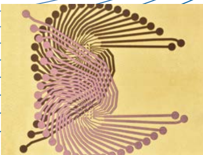
Removal of copper from double-sided PET film