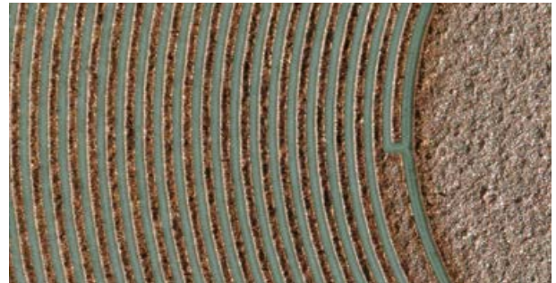
Silver paste DuPont ME614 on PET 30 µm/30µm (line/space)

The high-precision hardware and integrated camera are supported by the easy-to-use LPKF CircuitPro software. This enables the user to implement projects involving demanding materials in their own laboratory within a very short time.